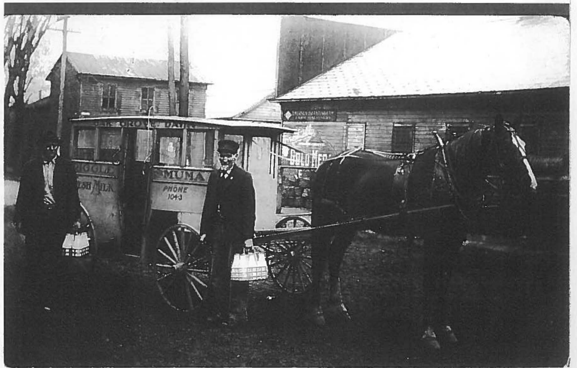
Riggle-Muma Milk wagon (Dall Grove Dairy) photo taken in Main St. square, looking towards corner of Main + Cross St. photo taken circa 1910