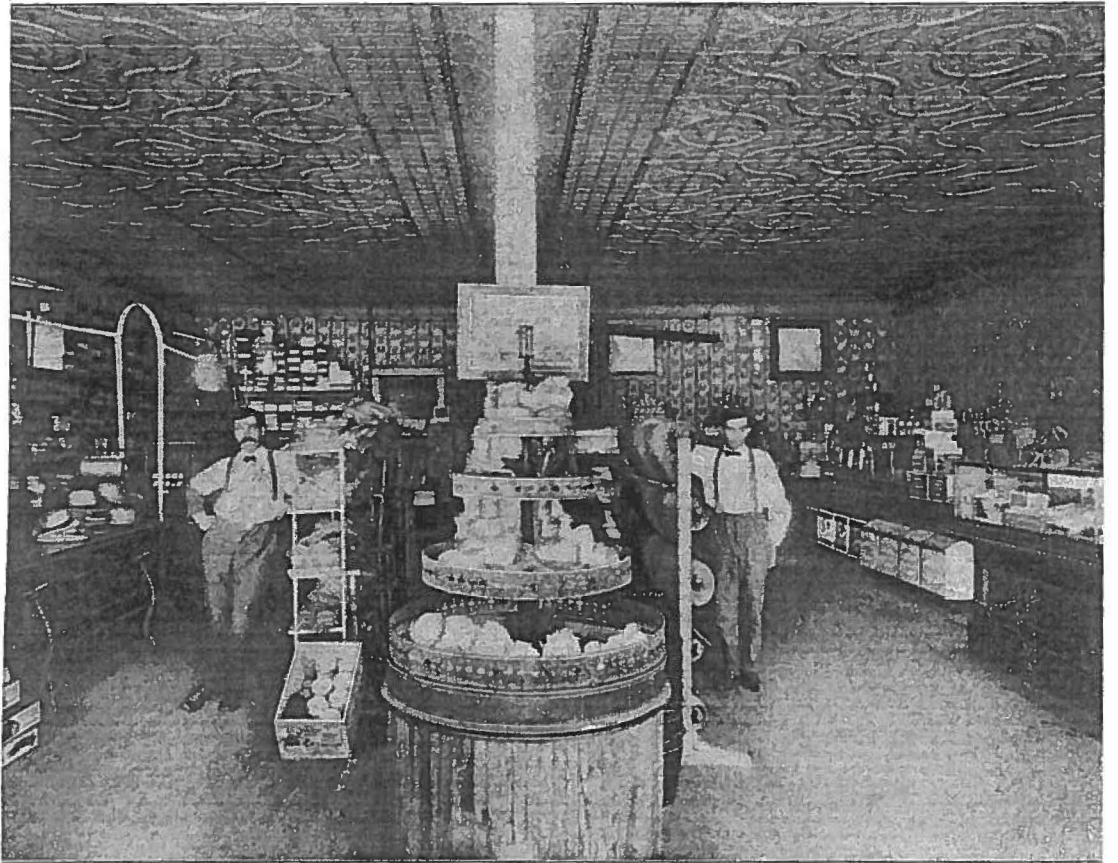
INTERIOR VIEW OF JOHN HINDS' STORE