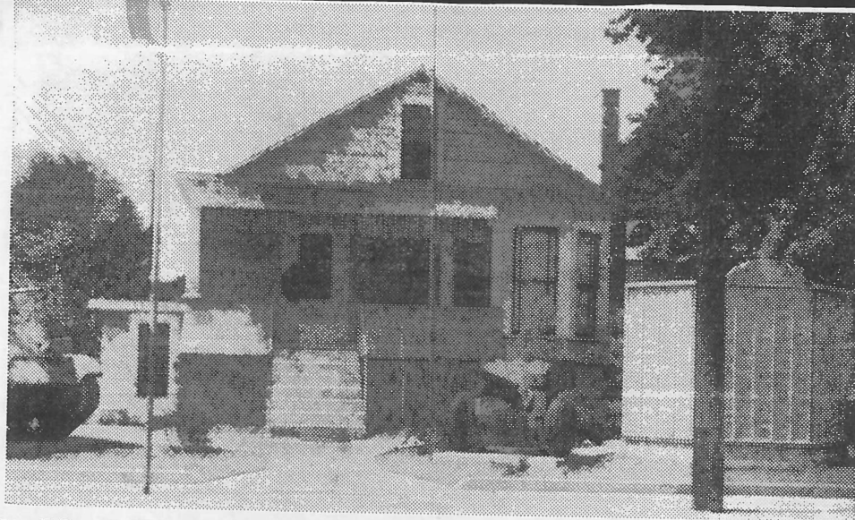
The World War II "Honor Roll" of local service men and women is shown at right, in the yard of the American Legion Home, Canal Court. The structure had three sides and each contained five columns of names. A total of 700, representing all branches of the armed forces, were listed. Before the honor roll was taken in 1947, each panel was photographed. Prints of the names are now in the archives of the local Legion home.